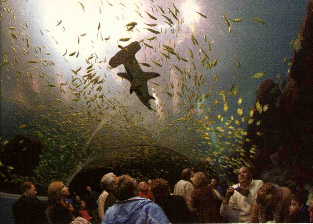
A 100-foot-long acrylic tunnel gives visitors the feeling of being a scuba diver in the depths of the sea—without the fear of hammerhead sharks coming too close!

The state's newest attraction, the $290 million Georgia Aquarium, is teeming with more than 100,000 creatures from around the globe. Normally trips to view these creatures in the wild would take years, a small fortune and a lot of luck, but this excursion takes less than a day. Thanks to a very generous gift from Bernie Marcus, the co-founder of The Home Depot, to the people of Georgia for helping him