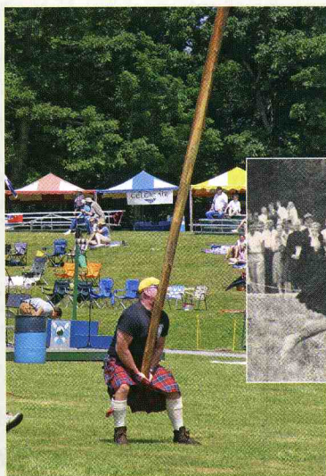
Caber chuckers. The traditional sport continues, 1958 (inset) and 2004 (above).